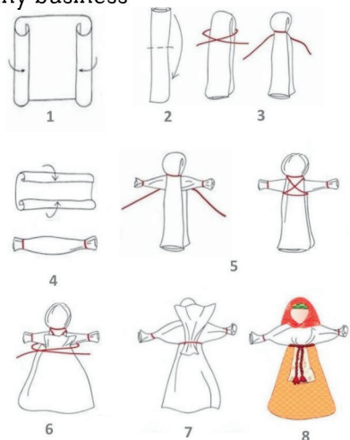
Simple instructions for a motanka doll