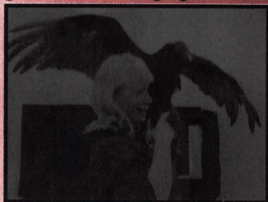
Birds of Prey program

Thank you to the schools, parents and care-givers for encouraging them.