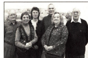
Participants in the Favorite Poetry Night.

Our first "Favorite Poem Night", was a success! Each participant explained why they selected the poetry before sharing.