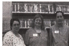
Media Desk Staff

The Media Department will help you find magazines, magazine articles, and audiovisual materials. If you need to create a letter, report, or resume, the Media Department offers computers with Microsoft Word, Excel, Access, PowerPoint, Publisher, and Perfect Resume.