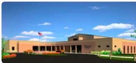
Randall Oaks Branch Library Lower Level, Randall Oaks Rec Center