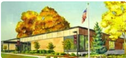
Dundee Library Located in East Dundee on Rt. 68.