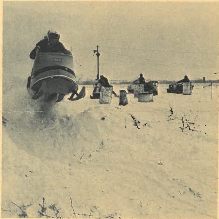
Shown above is the newly renovated entrance to the raceway area. Snowmobile races (left), one of many winter activities.